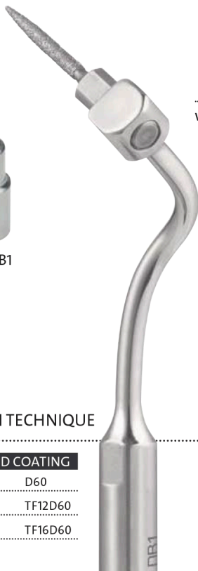
→ tip holder DB1 with crown prep tips