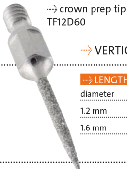
→ crown prep tip TF12D60