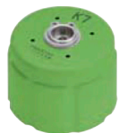
→ dynamometric wrench K7