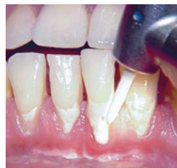
Easy calculus removal