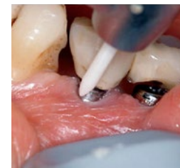
Gentle and efficient implant cleaning