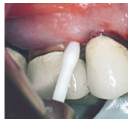
Effective root planing and surfacing