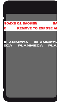
30019086 Light Protection Cover, Size 0 (100 pcs)

30037129 Planmeca imaging plate and light protection cover package, Size 1 (Imaging plates 2pcs, Light protection covers 1000pcs)