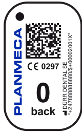
30019081 Image Plates, Size 0 (2 pcs)

30037128 Planmeca imaging plate and light protection cover package, Size 0 (Imaging plates 2pcs, Light protection covers 1000pcs)