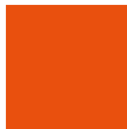
Dutch Orange K196

All Stamskin colours may be combined with each other to form bicolor colors