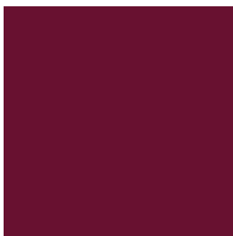
Burgundy Red K170