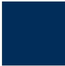
Dark Blue K89