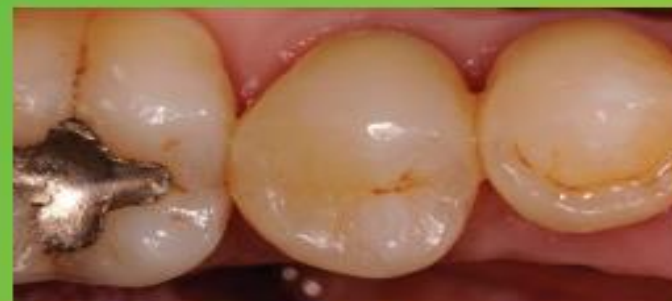
Fig. 9: Final restoration is very natural-looking and esthetic.