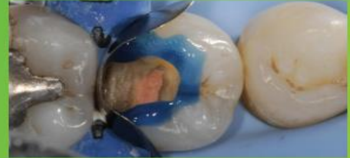
Fig. 3: Enamel is etched for 15 seconds using 3M™ Scotchbond™ Universal Etchant for a selective etch approach, followed by rinsing and drying.