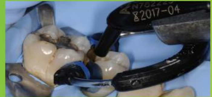
Fig. 6: 3M™ Filtek™ One Bulk Fill Restorative, in shade A3, is directly placed into the cavity in a single increment and then cured according to the Instructions for Use.