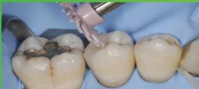
Fig. 8: A final high-gloss polish is created using the 3M™ Sof-Lex™ Diamond Polishing Spiral on a moist surface.