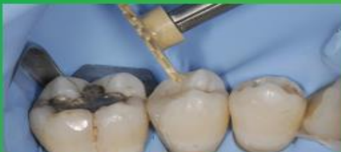
Fig. 7: Following finishing, to achieve the final polish of the restoration, the 3M™ Sof-Lex™ Pre-Polishing Spiral is used, as a first step, on a moist surface.