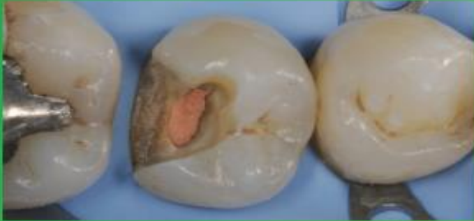
Fig. 1: Initial Situation: Second lower right premolar with a deep carious lesion restoration that required endodontic treatment. Image is showing the final preparation after removing the temporary filling.