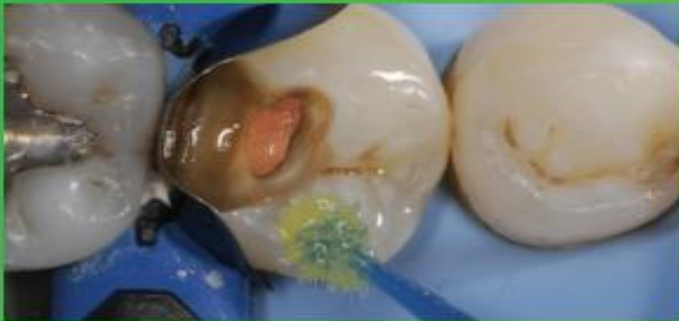
Fig. 4: 3M™ Scotchbond™ Universal Adhesive is applied and scrubbed into the surface for 20 seconds.